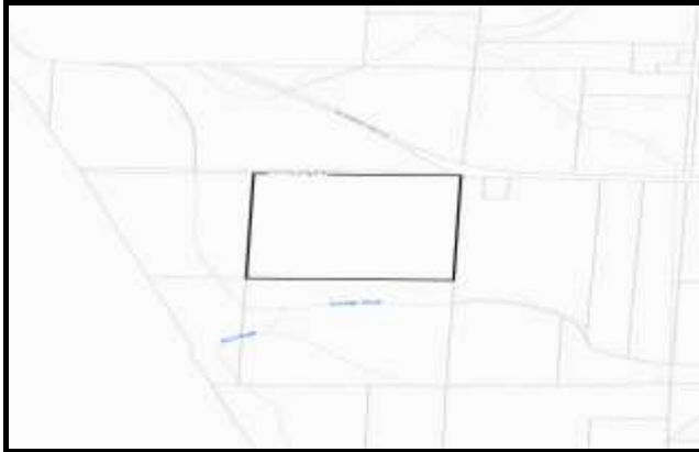
Figure 1. Location Map.