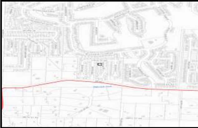
Figure 1. Location Map.