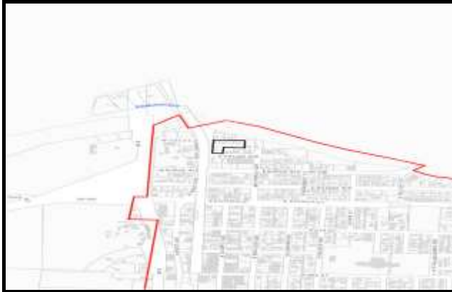
Figure 1. Location Map.