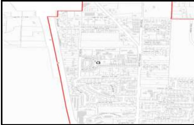
Figure 1. Location Map.