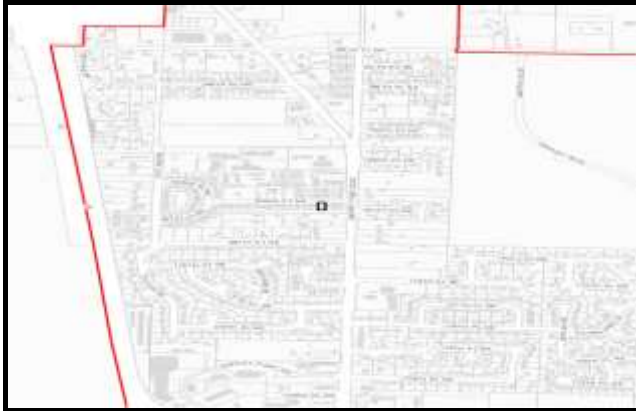
Figure 1. Location Map.