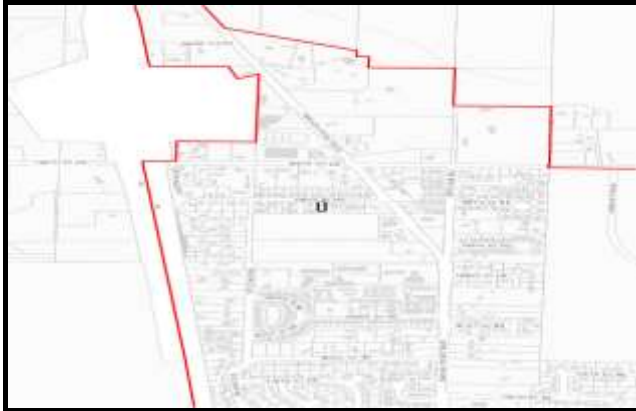
Figure 1. Location Map.