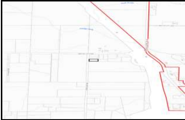
Figure 1. Location Map.