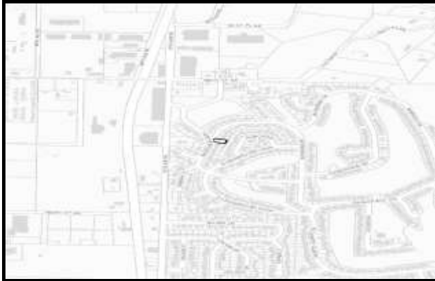
Figure 1. Location Map.