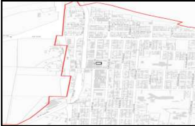
Figure 1. Location Map.