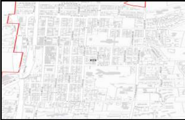
Figure 1. Location Map.