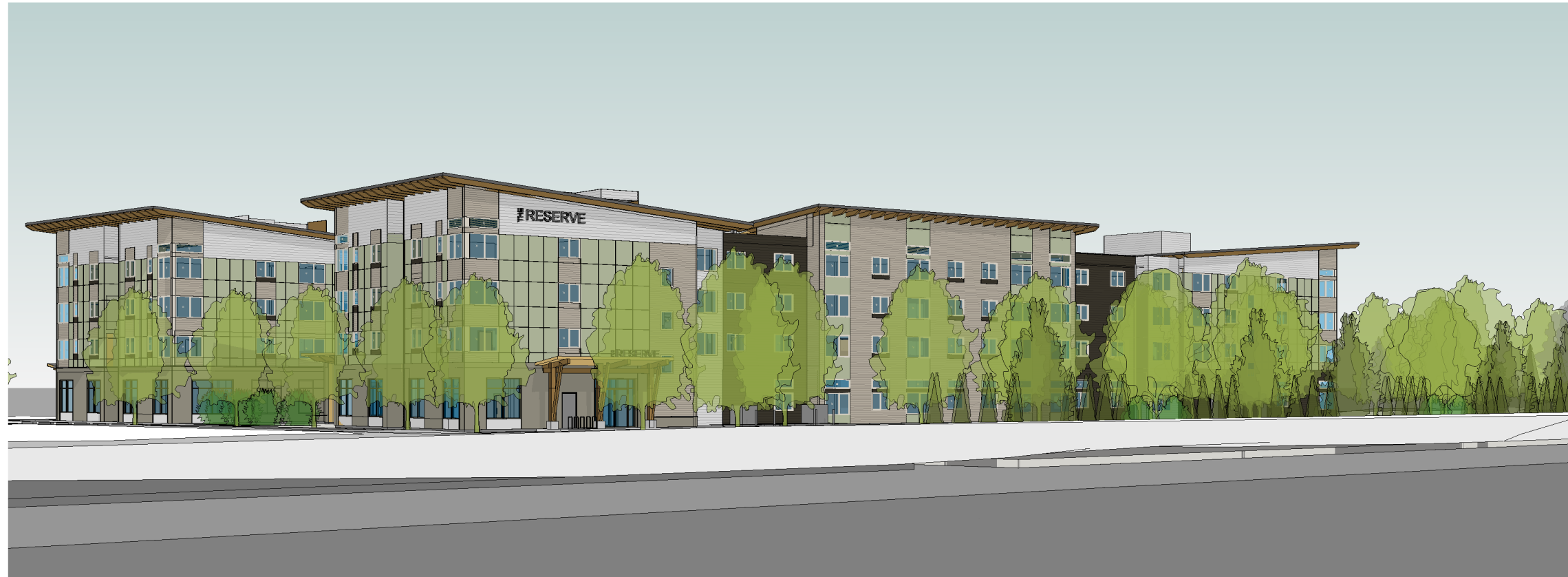
① VIEW LOOKING NW FROM HWY 9