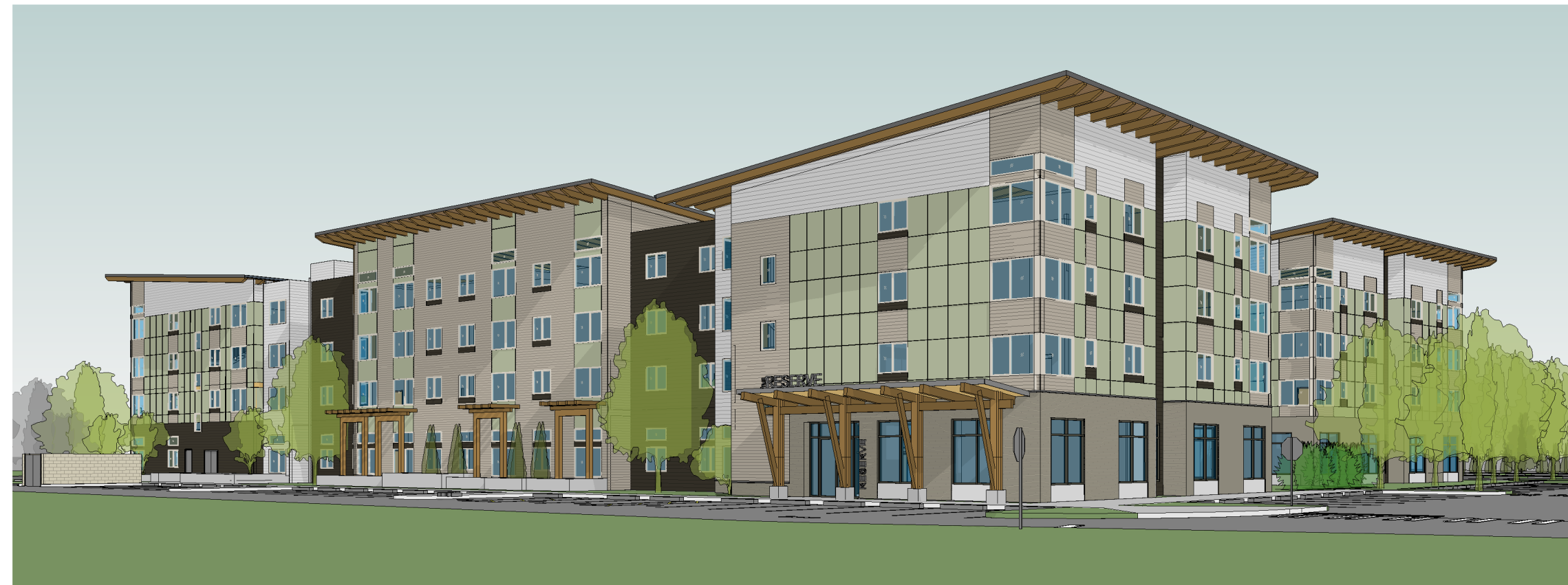
② VIEW NE FROM FUTURE 74TH AVE NE

TISCARENO ASSOCIATES ARCHITECTURE • URBAN DESIGN