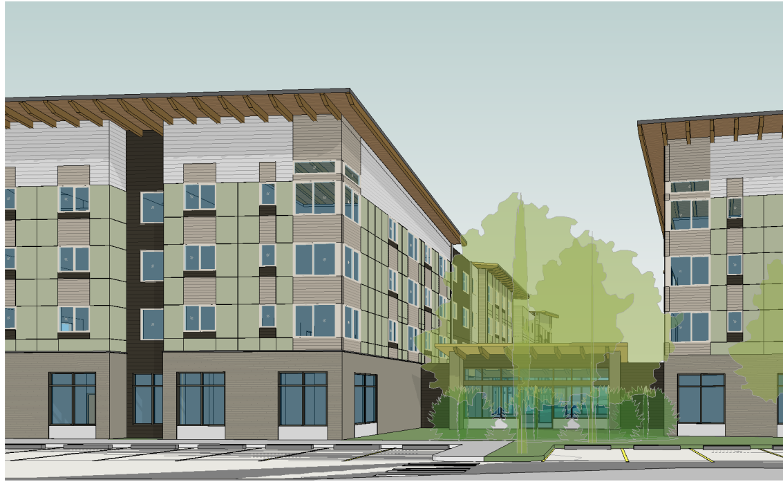
① VIEW NORTH TO GREAT ROOM