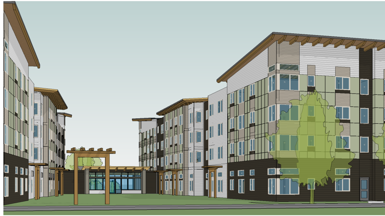
② VIEW LOOKING S. INTO COURTYARD