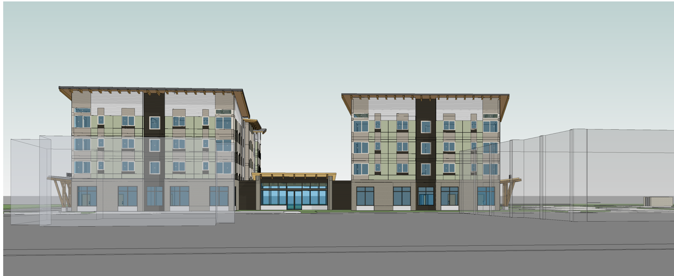
③ VIEW LOOKING NORTH FROM 204TH ST

TISCARENO ASSOCIATES ARCHITECTURE • URBAN DESIGN