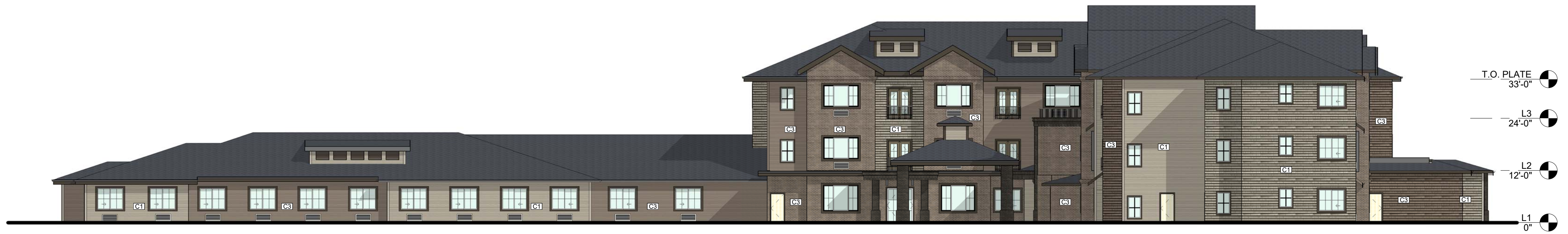
SOUTH ELEVATION 1/16" = 1'-0"