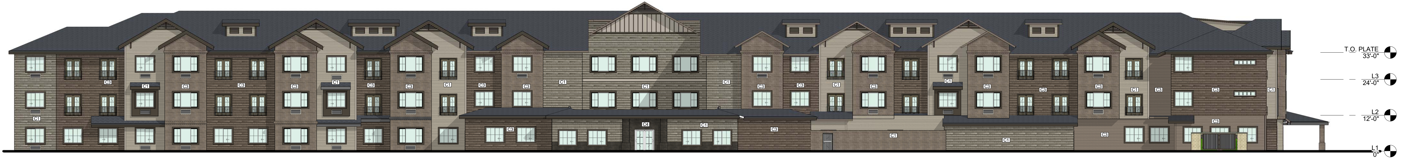
EAST ELEVATION 1/16" = 1'-0"