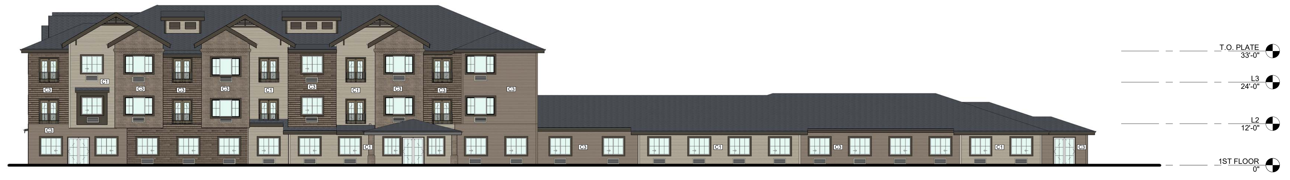
NORTH ELEVATION 1/16" = 1'-0"

BRENT LAMBETH, ARCHITECT 355 NW 48TH ST. SEATTLE, WA 98107 (303) 818-9430