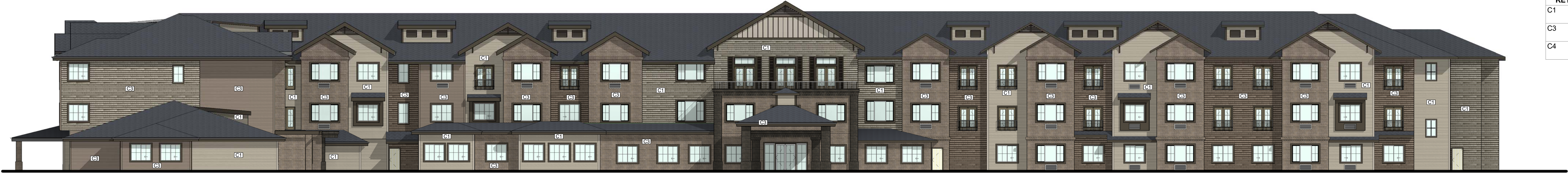
WEST ELEVATION 1/16" = 1'-0"