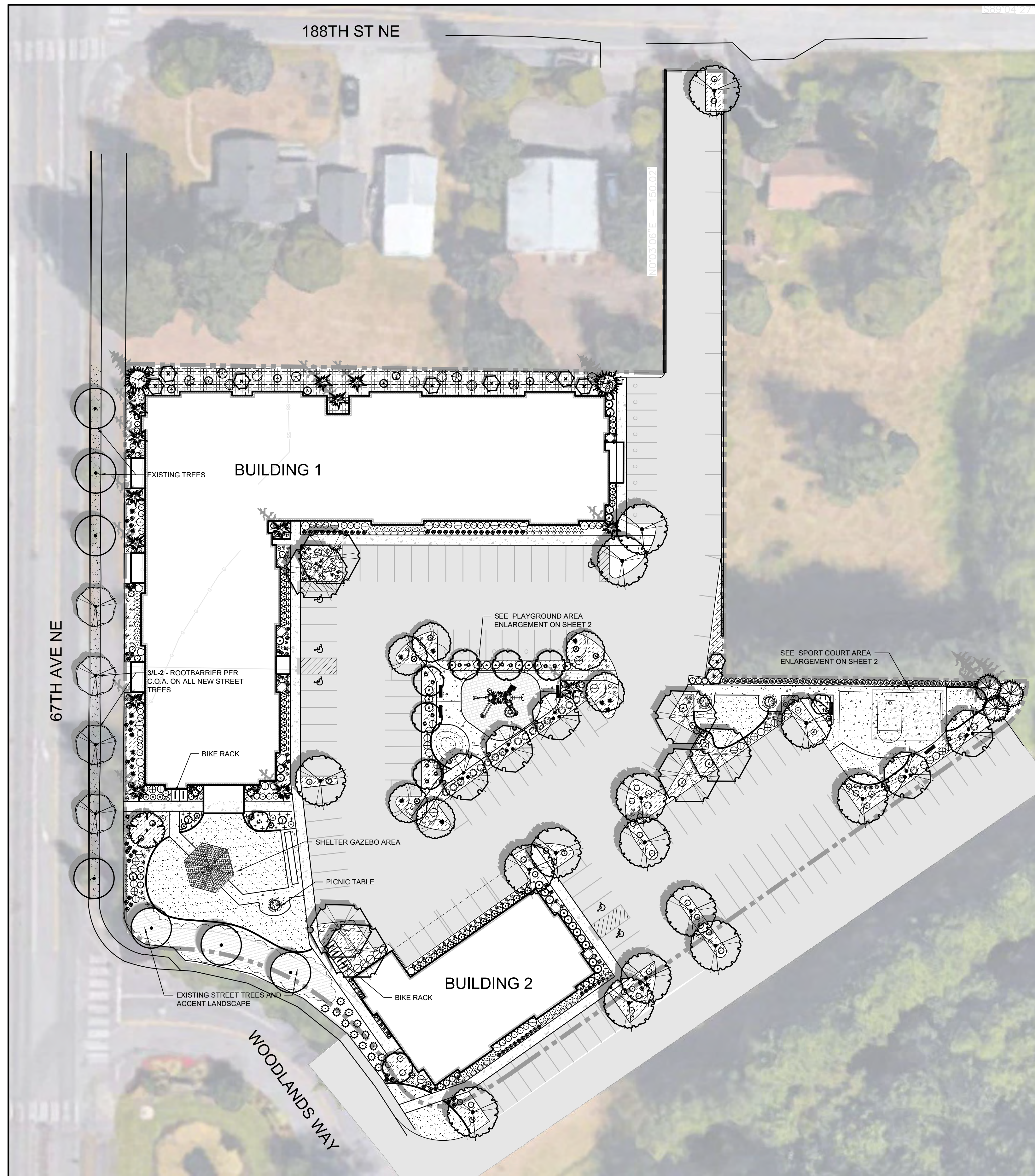
PLANTING PLAN 1" = 30'