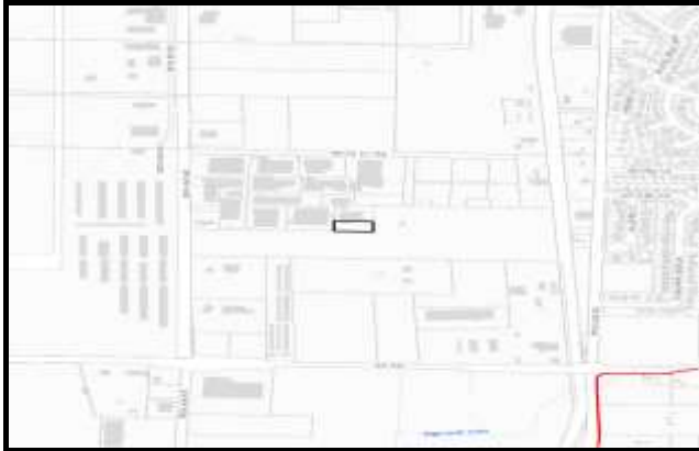
Figure 1. Location Map.