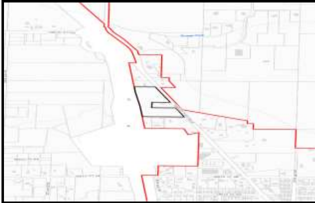
Figure 1. Location Map.