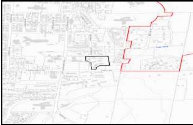
Figure 1. Location Map.