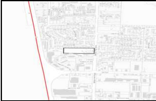
Figure 1. Location Map.