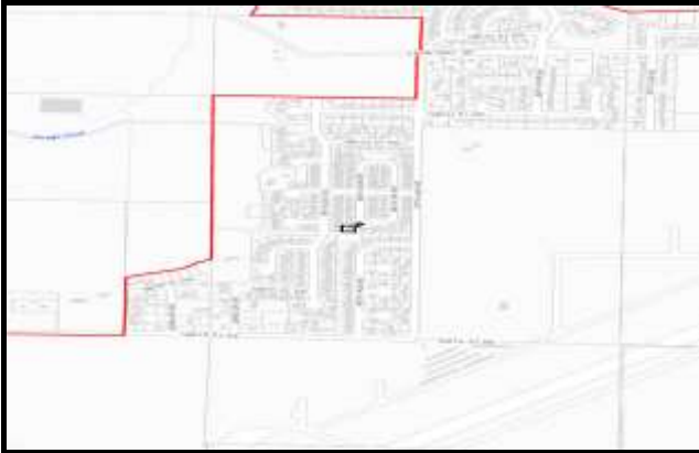
Figure 1. Location Map.