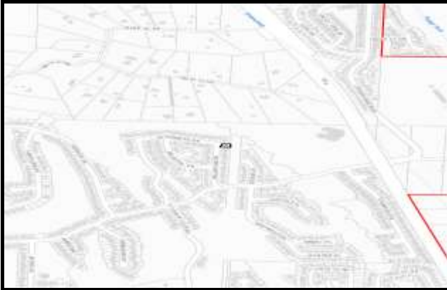
Figure 1. Location Map.