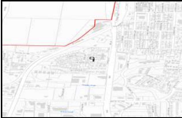
Figure 1. Location Map.